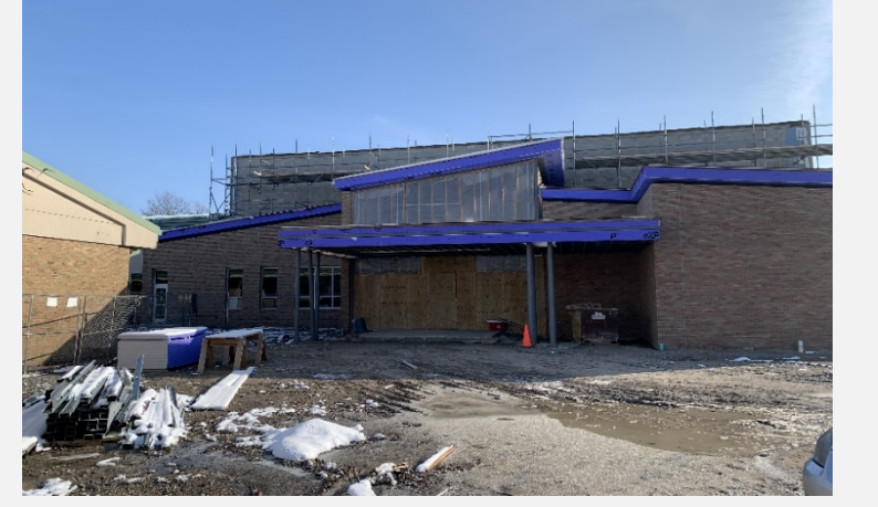
Phase 2 Addition: Multi-Purpose Gym Entry