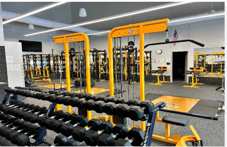
MS/HS Weight Room

The Series 3 bond sale is scheduled for Spring of '24 with program completion planned for late 2024.