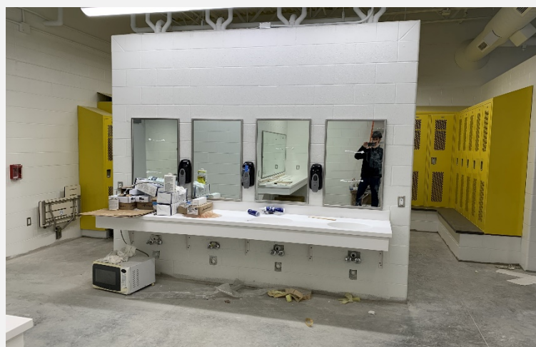
Varsity Locker Room