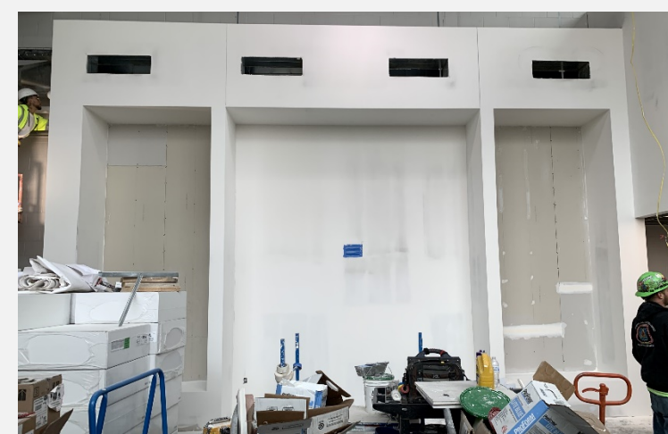
Multi-Purpose Gym Entry