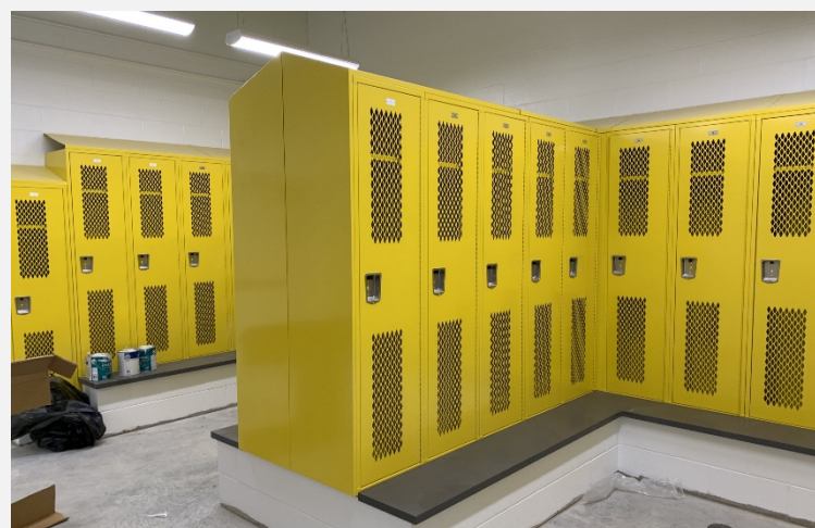
Varsity Locker Room