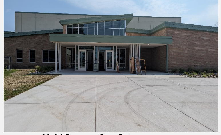
Multi-Purpose Gym Entry