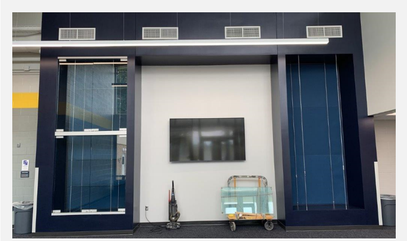
Multi-Purpose Gym Vestibule