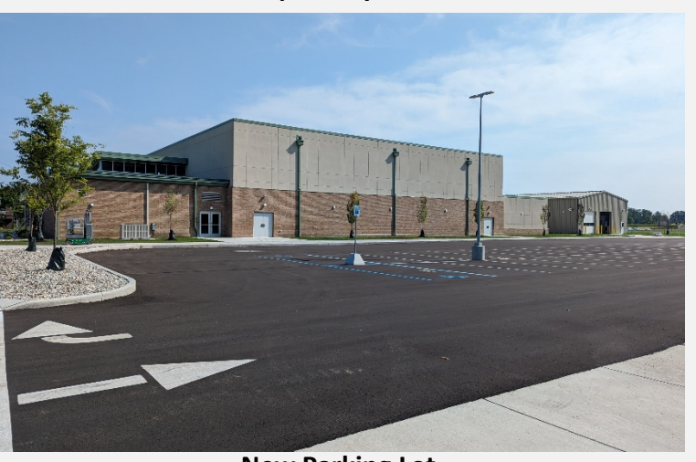
New Parking Lot