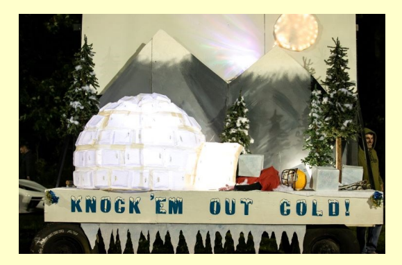
FRESHMAN FLOAT (WINNER)