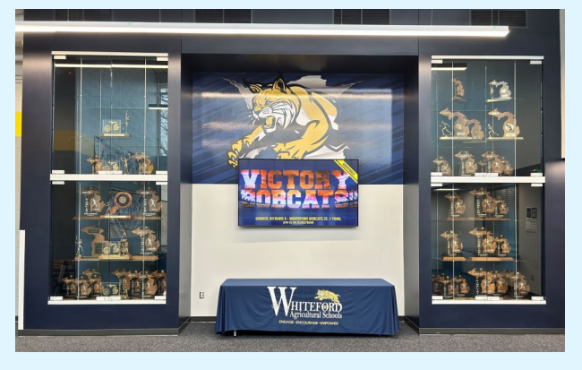
Multi-Purpose Gym Vestibule