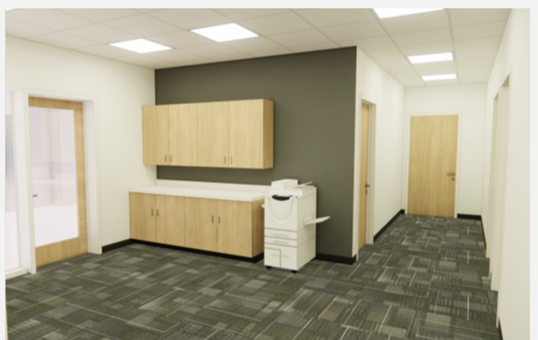
Science Classroom Central Office