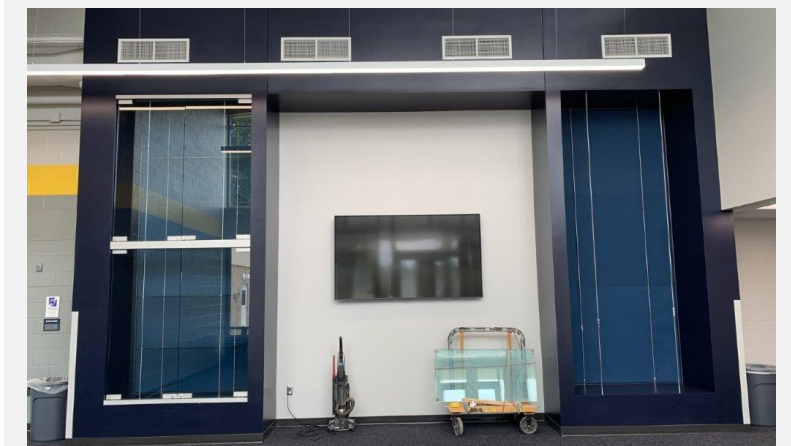
Multi-Purpose Gym Vestibule