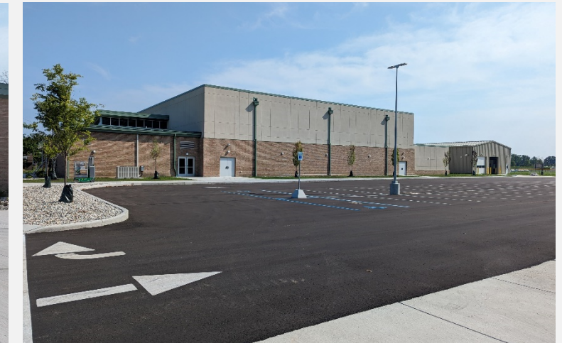
New Parking Lot