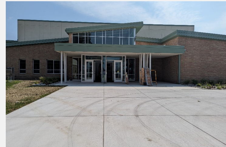
Multi-Purpose Gym Entry