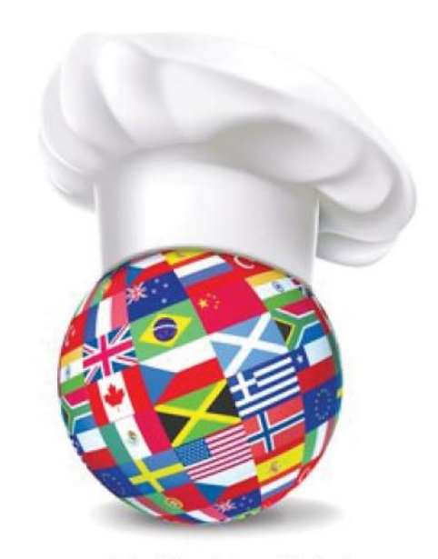
Take Nutrition Global