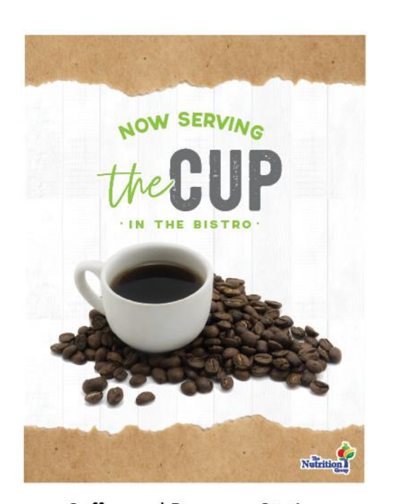
Coffee and Beverage Stations