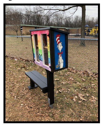
Have a seat, relax, and browse through the selection of books.